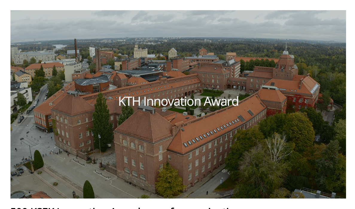
500 KSEK Innovation Award open for nomination