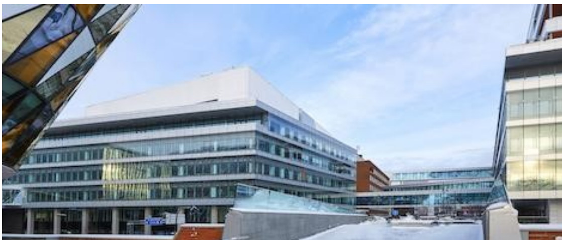
MedTechLabs facilities in BioClinicum, Karolinska University hospital

News from MedTechLabs – a multidisciplinary research centre hosted at SCI